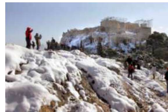
Atene, turisti fotografano l'Acropoli innevata